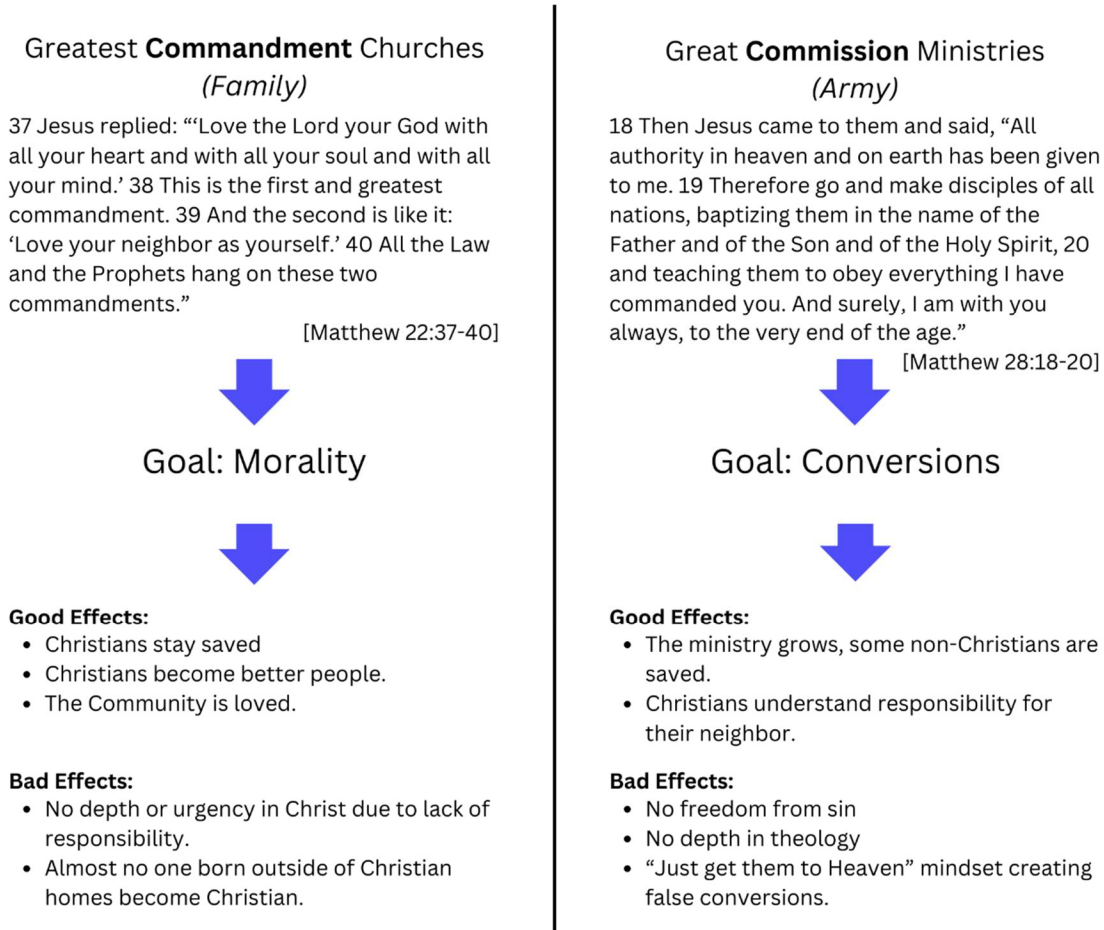
Figure 1: Commandment vs Commission

Many Christian groups end up falling into one of two partial gospels: